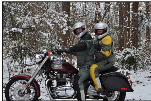
What year was this picture taken? Not 2012 Not complaining, where is winter??

It is 3 hours there from Raleigh no matter the route. Right now I am leaning towards going in 4 wheels heading down US 1 then pick up 24/27 and follow that to 74 which dumps into downtown Charlotte pretty darn close to the convention center. Leave here around 8am. Pete